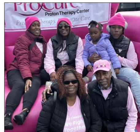
A family on an inflatable, photo taken Oct. 21