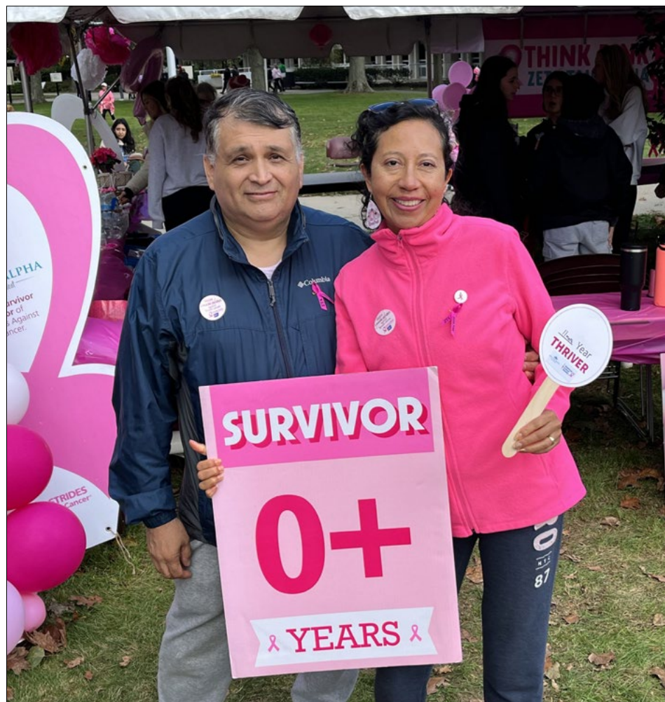
A couple taking a picture and holding up signs, photo taken Oct. 21