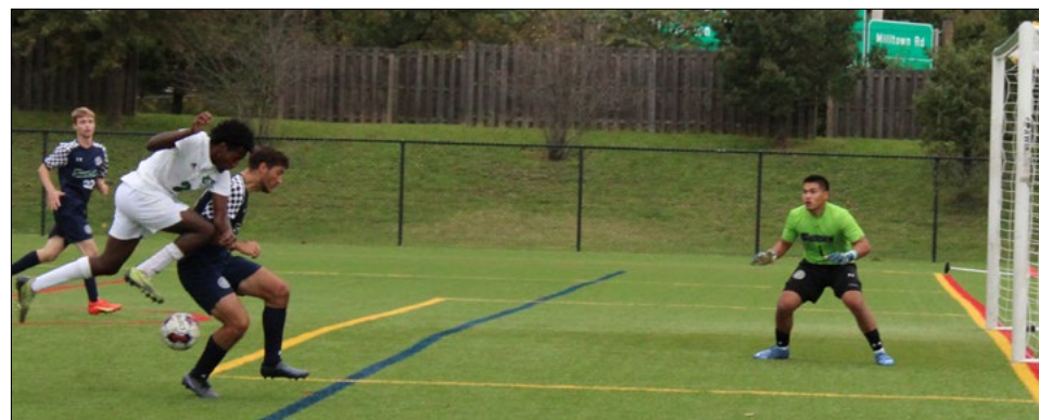
Allan Solomon colliding with the Sussex defender after taking a shot