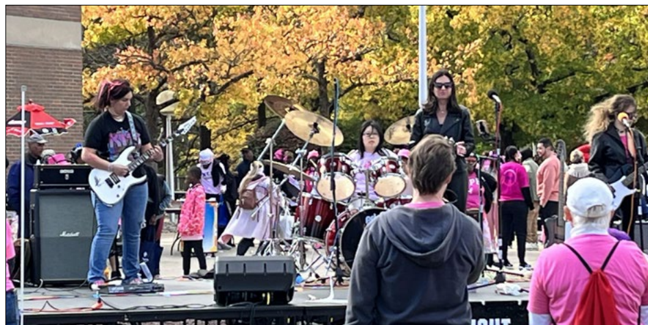
A band playing at the Breast Cancer Awareness walk at Middlesex College's Edison Campus, photo taken Oct. 21.