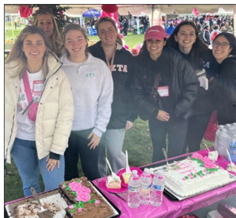
A stand at the Breast Cancer Awareness Walk, photo taken Oct. 21